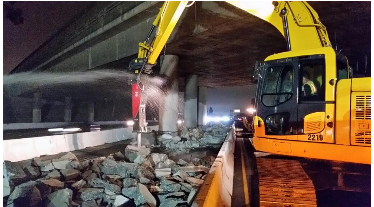
Median concrete barrier removal