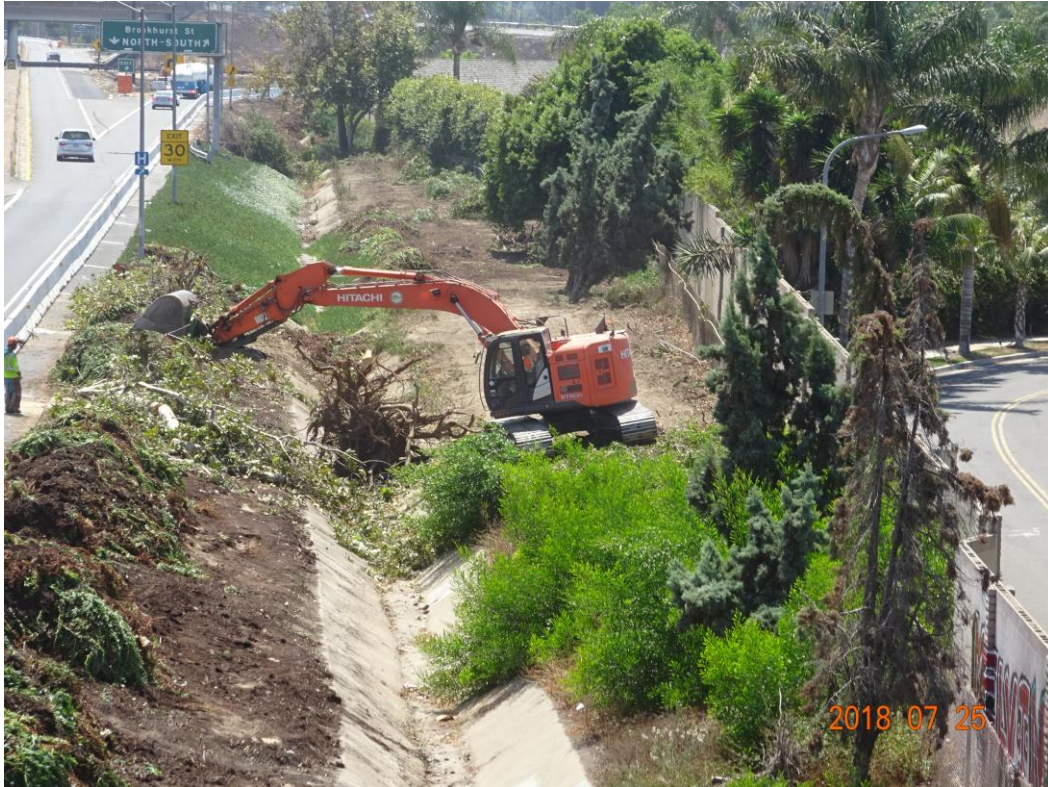
Clearing and grubbing