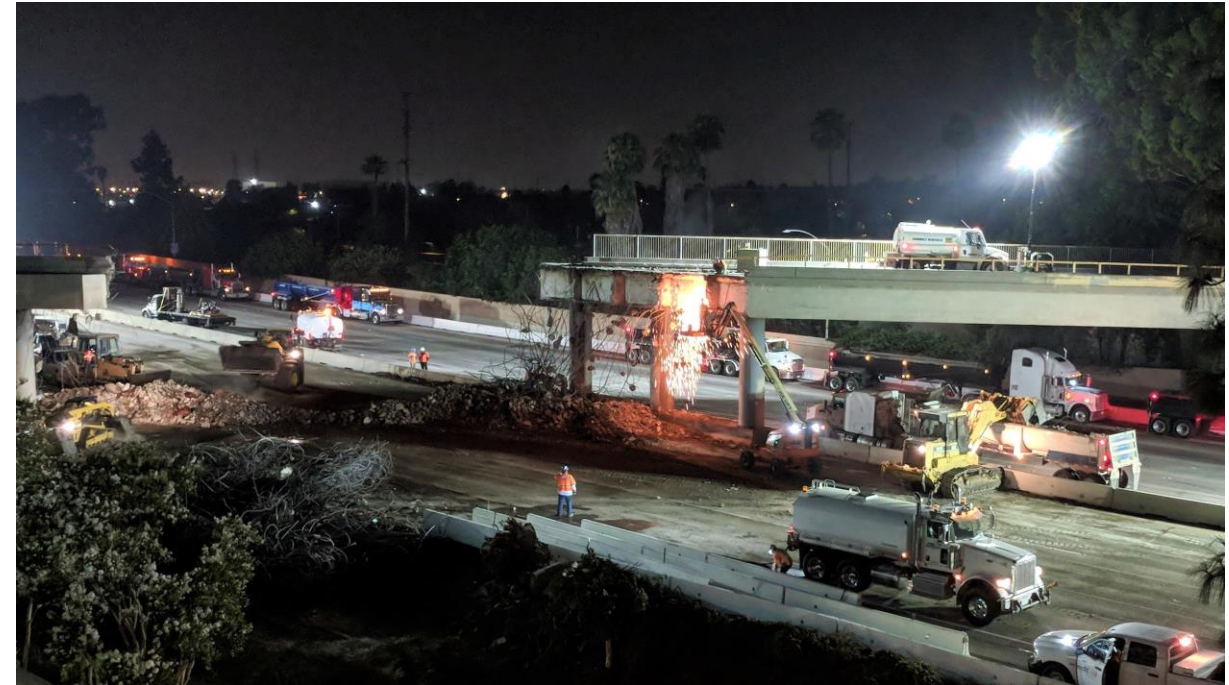
McFadden Avenue bridge demolition