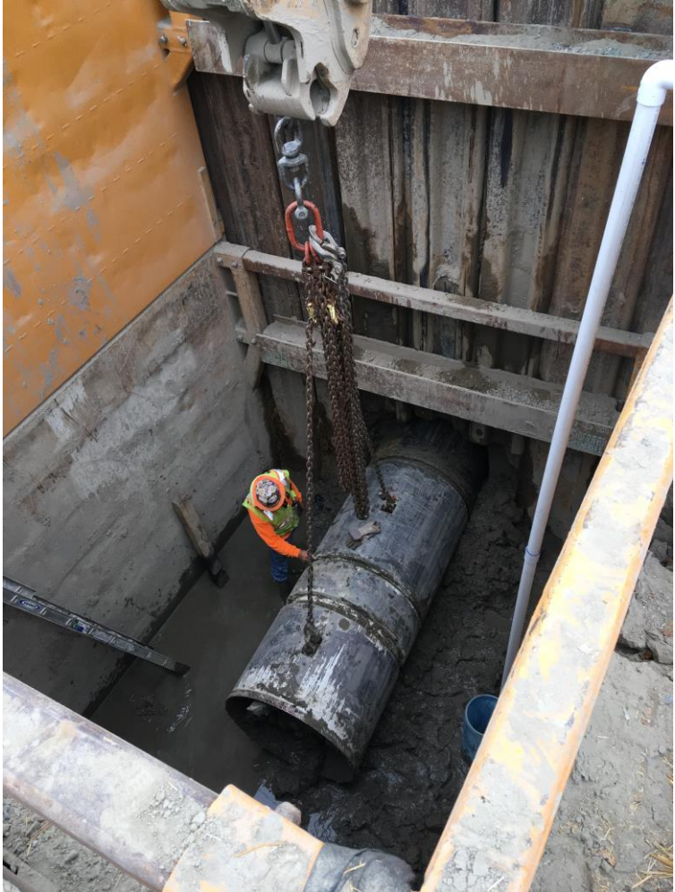
First utility relocation