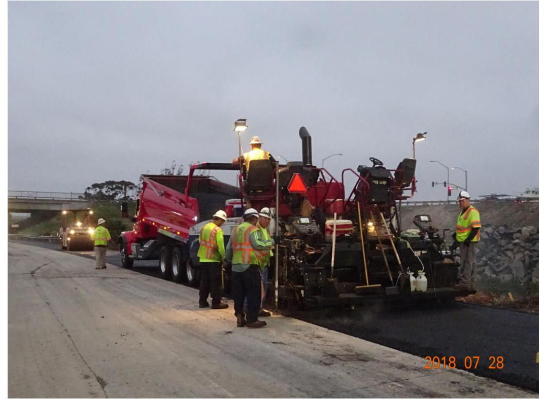
Temporary asphalt paving